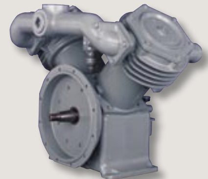
ATLE6-GD Single Stage Compressor