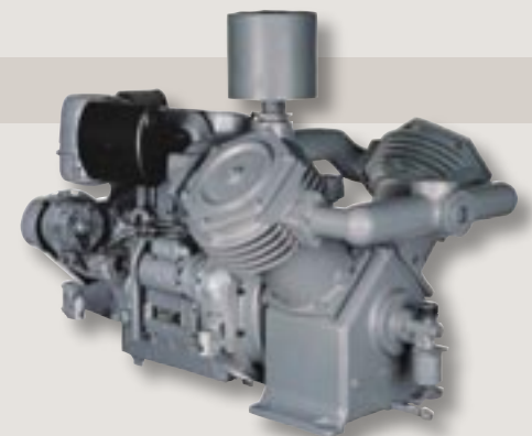
ATLE6-GD Typical ATLE6-GD compressor direct connected to an internal combustion engine. Note: Engine and coupling supplied by others.