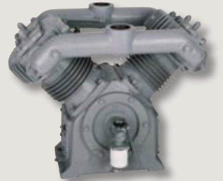
AVLEKCAA-GD Single Stage Vacuum Pump