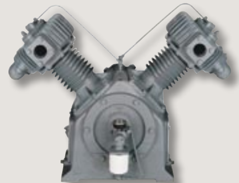
AVLANCAA-GD Single Stage Booster