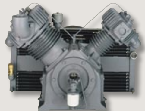
AVLAVCAA-GD Two Stage Compressor