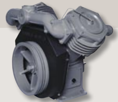
APL Single Stage Compressor